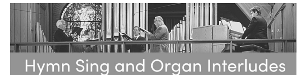
Hymn Sing and Organ Interludes

An Offering Treasure Box is in the Side Atrium by the Rainforest Explorer Bulletin Board. Everyone is invited to view the Digital VBS on the Immanuel website starting Monday, June 1st, and learn more about our VBS Mission Project in support of those in need in the Seymour Community. You can mail in your offering or let your children drop off their offering in the treasure Box. Thank you for serving those in need.